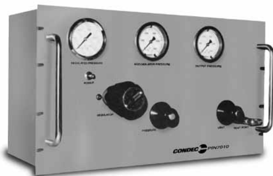
PIN 7010 Rack-mount

These pressure intensifying systems were designed for custom use. The compact PIN7000 incorporates a portable configuration for on-the-go operation. The rugged PIN7010 is a rack-mount model, ideal for frequent in-house use.