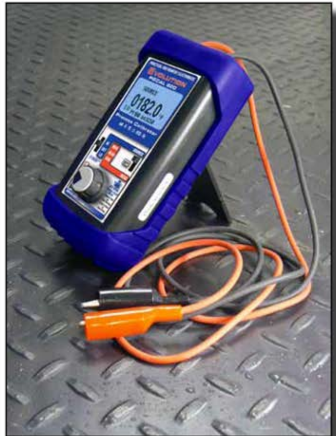
Flip out stand for bench use

Ni-MH 1 Hour Charger with 4 Ni-MH AA Batteries Part No. 020-0103 (100-120 V AC input for North America Only) (100-120 V AC input for North America Only)