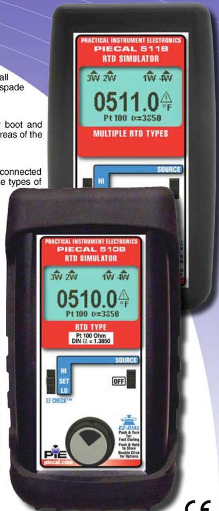
Actual Size (Shown with optional boot)