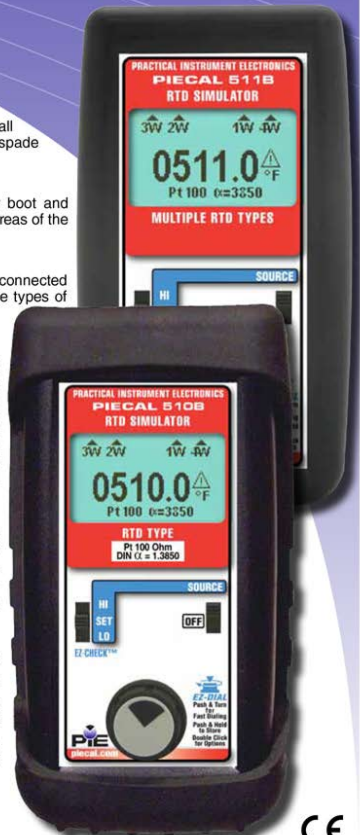
Actual Size (Shown with optional boot)